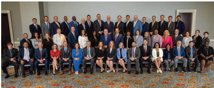
STATE BAR of TEXAS ★ 2023-2024 BOARD OF DIRECTORS